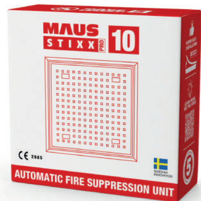
MAUS Stixx PRO 10 product box.

An additional heat detecting cable can be inserted on the side of the unit.